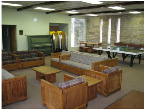
Robins South Cabin